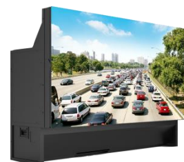
Laser Light Source