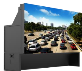
LED Light Source